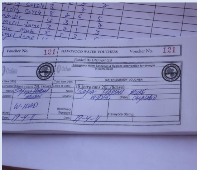
Figure 3 Water Voucher. In the background is the log book indicating the quantity of water taken by beneficiaries on a daily basis.

Oxfam and partner staff reported that the logistical workload was substantially less than a directly-implemented water trucking intervention. They also reported that this methodology could be utilized in insecure areas and managed remotely. The overall view of the staff was that this methodology is ultimately more transparent and empowers communities.